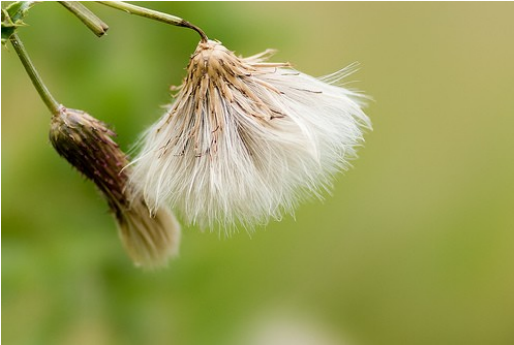
This month's thistledown photo is by Ben Cooper (see the Editor's Corner for more info)