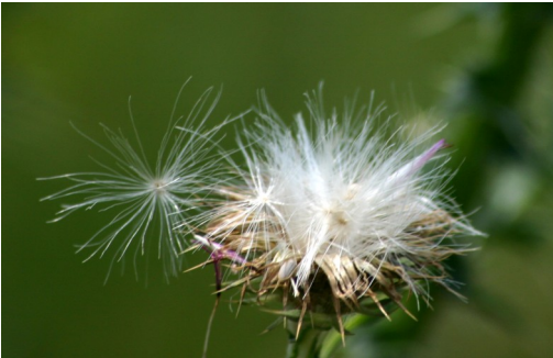
This month's image is from Wikipedia and was published under the GNU open licensing. Thanks to whomever posted it!