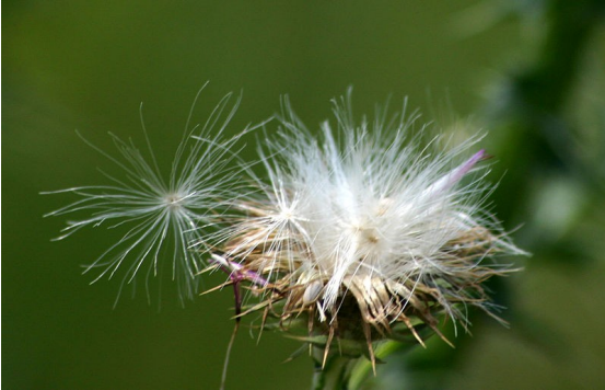
This month's image is from Wikipedia and is used under the GNU Free Documentation License.