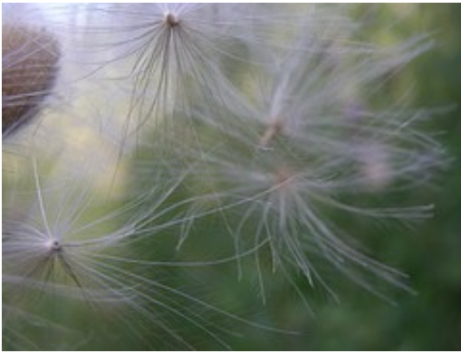
This month's thistledown photo is by Eva the Weaver (see the Editor's Note for more info)