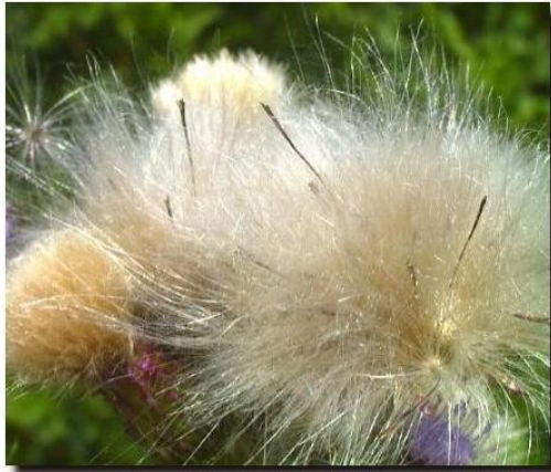
This month's image is from Scotland. http://rampantscotland.com/flowers/autumn_c.htm

Open stage poetry reading will follow Craig's presentation.