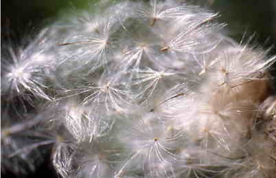
This month's image is used with permission by the photographer Brian Ecott of the United Kingdom. http://www.hainaultforest.co.uk/3Fruits.htm